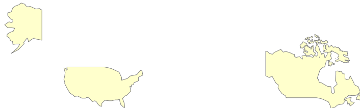
Two Experiences: One for US (Region='US') and one for Canada (Region='CA').