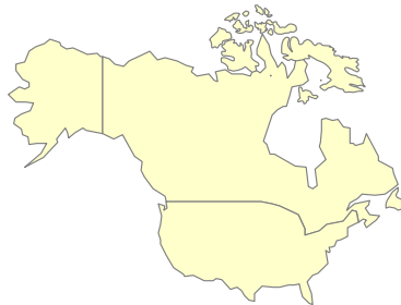
One Experience for US and Canada together (Region='US', Region='CA')